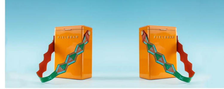
Maxhosa Africa, renowned for its fusion of tradition and contemporary design, is embarking on a journey to redefine luxury living. In a strategic move to expand its lifestyle offerings, the fashion powerhouse has ventured into a ground-breaking collaboration with Fieldbar, a trendsetting cooler box brand. This is to create an enticing blend of style and functionality.

Get the latest news about brands in the African continent.